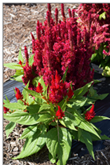
Fresh Look Red Celosia in bloom