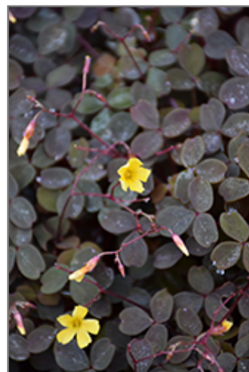
Zinfandel Shamrock flowers