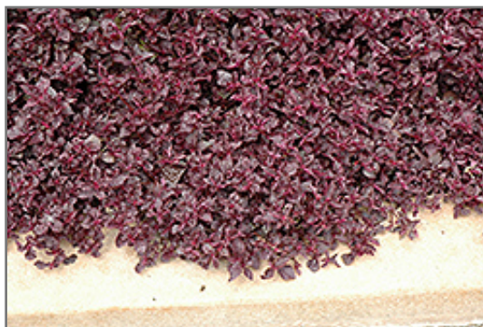
Purple Lady Blood Leaf