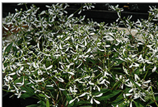
Silver Fog Euphorbia flowers