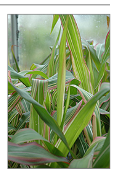
Field Of Dreams Ornamental Corn foliage

This plant does best in full sun to partial shade. It prefers to grow in average to moist conditions, and shouldn't be allowed to dry out. It is not particular as to soil type or pH. It is somewhat tolerant of urban pollution. This is a selection of a native North American species.