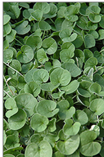
Emerald Falls Dichondra foliage