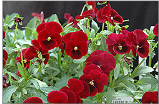
Red Selection Pansy flowers