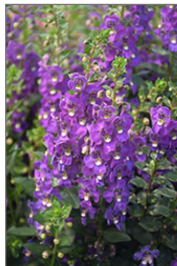
Archangel Purple Angelonia flowers

Archangel Purple Angelonia is recommended for the following landscape applications;