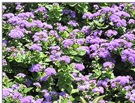
Hawaii Blue Flossflower in bloom