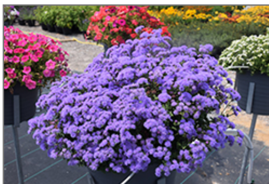
Artist Blue Flossflower in bloom