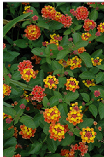
Landmark Citrus Lantana flowers