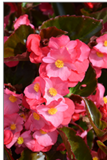
Big Rose Bronze Leaf Begonia flowers

Big Rose Bronze Leaf Begonia is recommended for the following landscape applications;