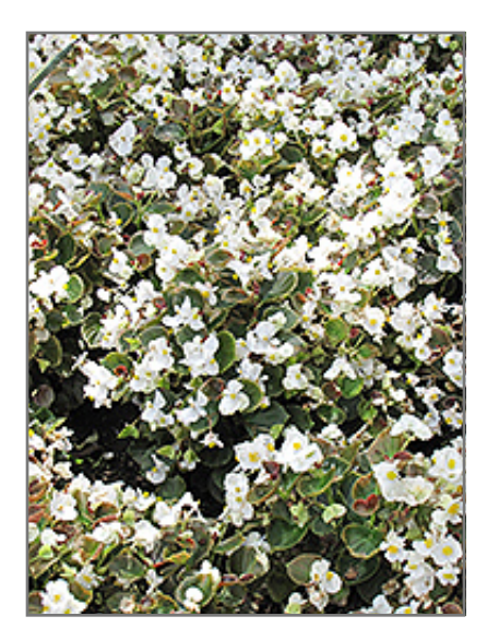
Bada Boom White Begonia in bloom