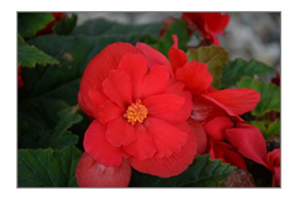
Nonstop Red Begonia flowers