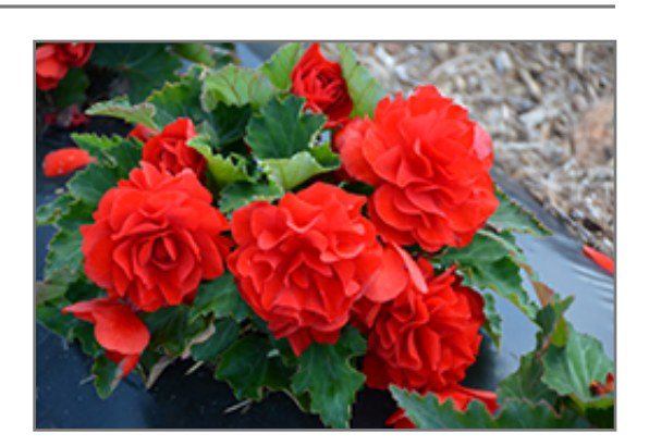
Nonstop Red Begonia in bloom