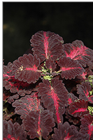
Black Dragon Coleus foliage