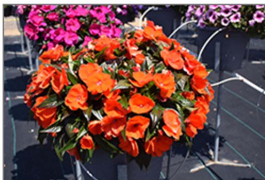
Sonic Orange New Guinea Impatiens in bloom