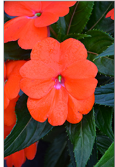
Sonic Orange New Guinea Impatiens flowers

Sonic Orange New Guinea Impatiens is a fine choice for the garden, but it is also a good selection for planting in outdoor containers and hanging baskets. It is often used as a 'filler' in the 'spiller-thriller-filler' container combination, providing a mass of flowers against which the thriller plants stand out. Note that when growing plants in outdoor containers and baskets, they may require more frequent waterings than they would in the yard or garden.