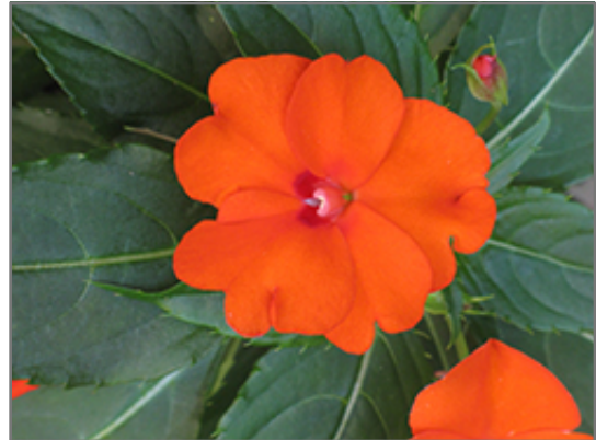
Infinity Orange New Guinea Impatiens flowers

Infinity Orange New Guinea Impatiens is recommended for the following landscape applications;