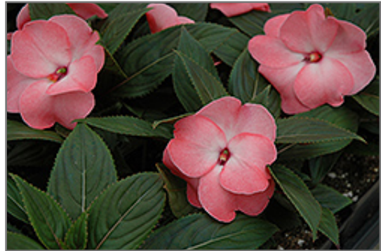
Celebrette Salmon Frost New Guinea Impatiens flowers

Celebrette Salmon Frost New Guinea Impatiens is recommended for the following landscape applications;