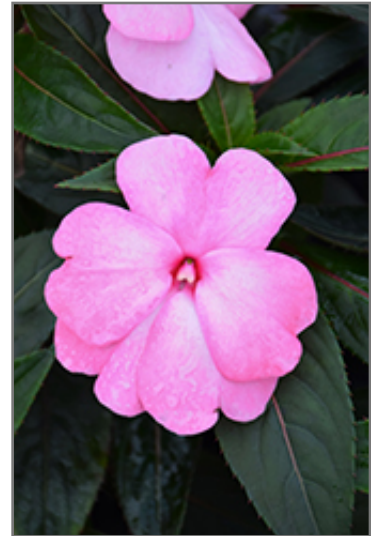
Super Sonic Pastel Pink New Guinea Impatiens flowers