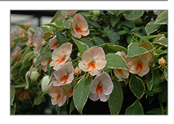
Fusion Peach Frost Impatiens flowers