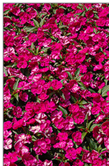
Fanfare Fuchsia Impatiens flowers