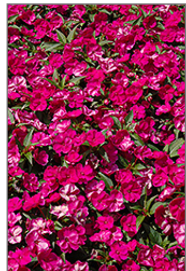
Fanfare Fuchsia Impatiens flowers