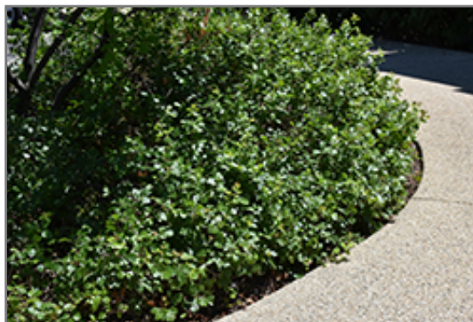
Gro-Low Fragrant Sumac