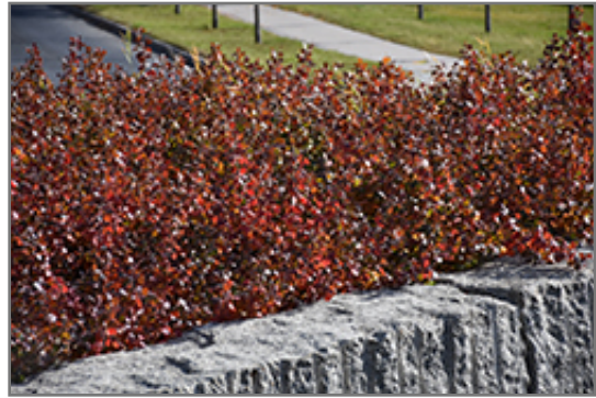
Gro-Low Fragrant Sumac in fall

This plant is not reliably hardy in our region, and certain restrictions may apply; contact the store for more information.