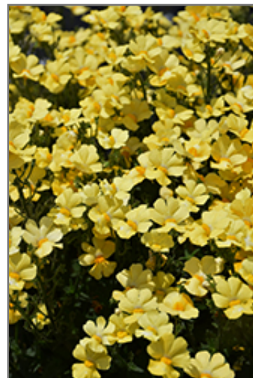
Sunsatia Lemon Nemesia flowers