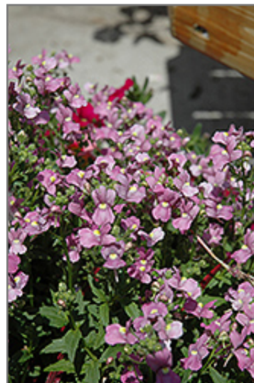
Compact Pink Innocence Nemesia flowers