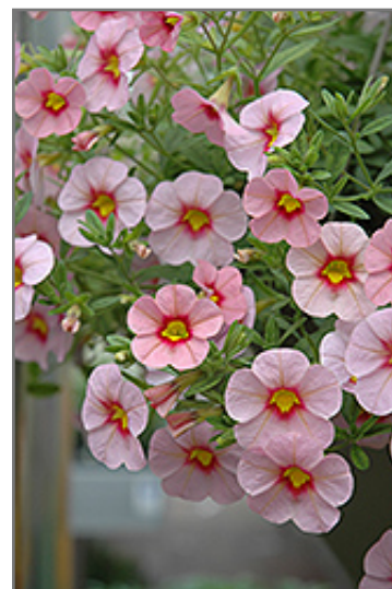
Aloha Tiki Soft Pink Calibrachoa flowers