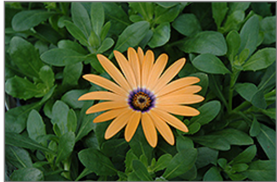
Orange Symphony African Daisy flowers