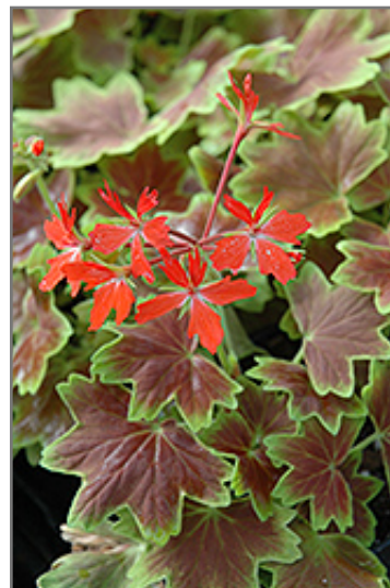
Vancouver Centennial Geranium flowers