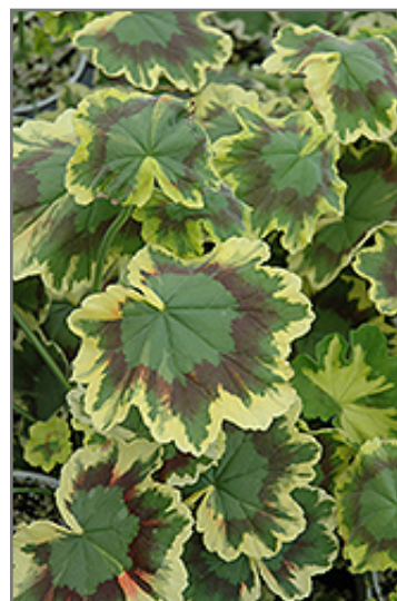
Tricolor Geranium foliage