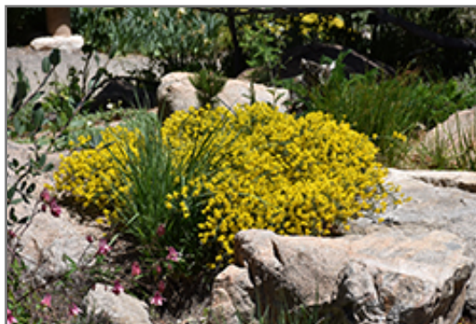
Vancouver Gold Woadwaxen in bloom