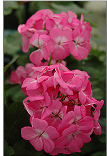
Pillar Pink Geranium flowers