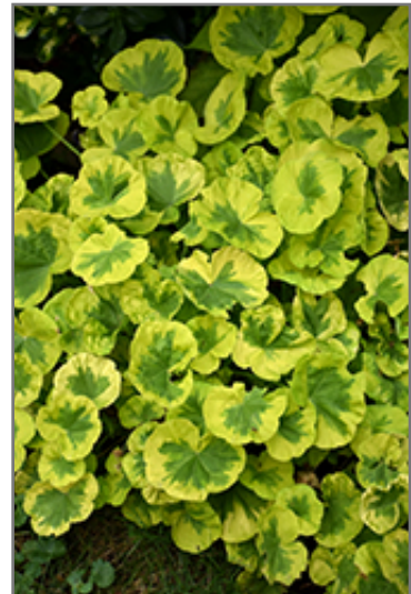
Crystal Palace Gem Geranium foliage