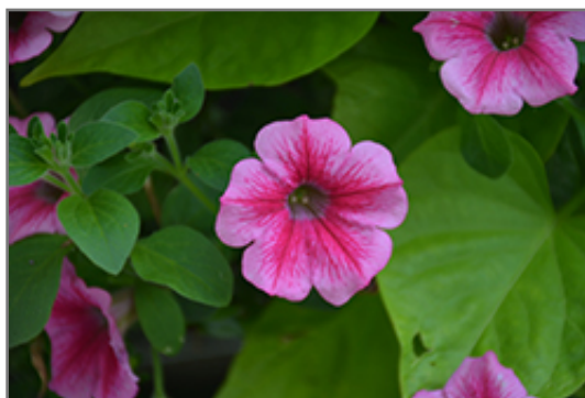
Supertunia Mini Strawberry Pink Vein Petunia flowers