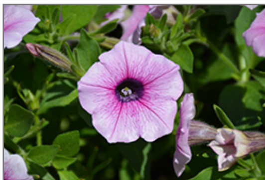
Shock Wave Pink Vein Petunia flowers