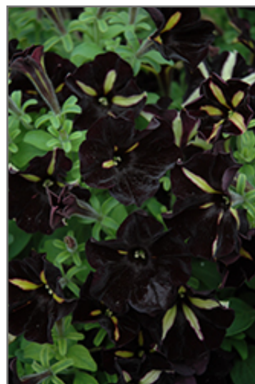
Phantom Petunia flowers