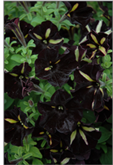
Phantom Petunia flowers