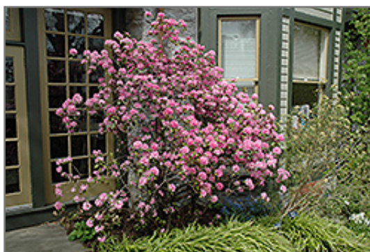
Olga Mezitt Rhododendron in bloom