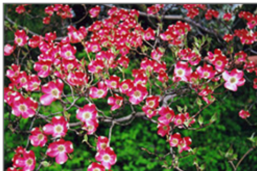
Red Giant Flowering Dogwood flowers