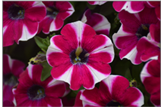
Cascadias Bicolor Cabernet Petunia flowers