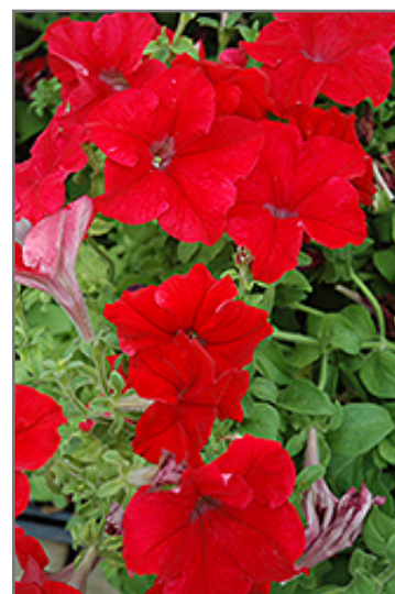
Dreams Red Petunia flowers