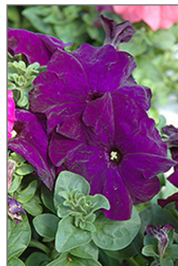
Dreams Midnight Petunia flowers