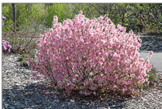
Cornell Pink Rhododendron in bloom