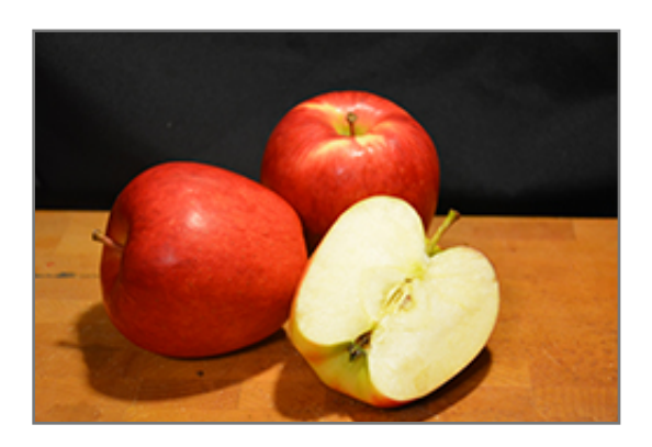
Ambrosia Apple fruit and flesh