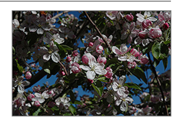
Ambrosia Apple flowers

This plant is not reliably hardy in our region, and certain restrictions may apply; contact the store for more information.