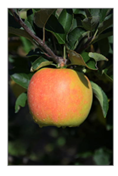
Ambrosia Apple fruit

Ambrosia Apple features showy clusters of lightly-scented white flowers with shell pink overtones along the branches in mid spring, which emerge from distinctive rose flower buds. It has forest green deciduous foliage. The pointy leaves turn yellow in fall. The fruits are showy red apples with a light green blush, which are carried in abundance in late summer. The fruit can be messy if allowed to drop on the lawn or walkways, and may require occasional clean-up.