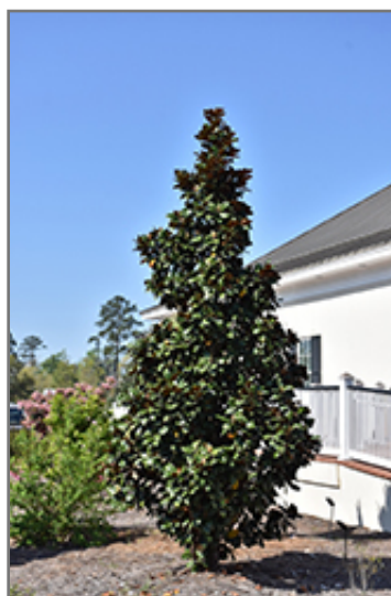
Teddy Bear Magnolia