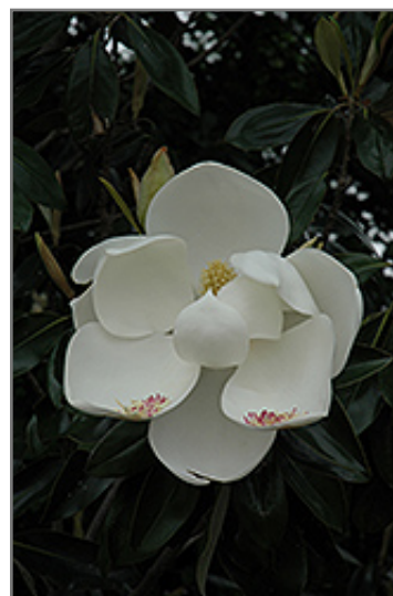
Teddy Bear Magnolia flowers