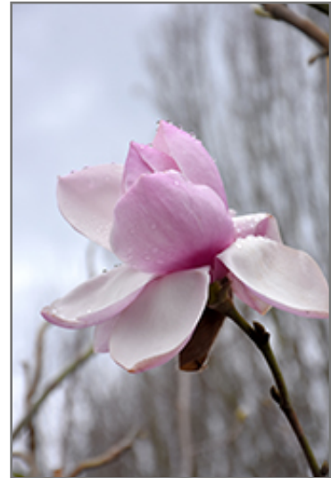
Iolanthe Magnolia flowers

This shrub does best in full sun to partial shade. It requires an evenly moist well-drained soil for optimal growth, but will die in standing water. It is not particular as to soil type, but has a definite preference for acidic soils. It is somewhat tolerant of urban pollution. Consider applying a thick mulch around the root zone in winter to protect it in exposed locations or colder microclimates. This species is not originally from North America.