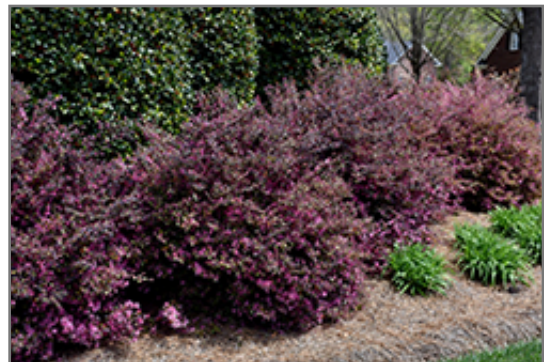
Purple Diamond Fringeflower in bloom