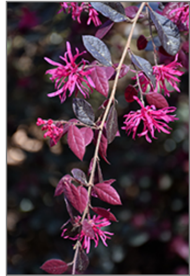
Purple Diamond Fringeflower flowers

Purple Diamond Fringeflower is recommended for the following landscape applications;