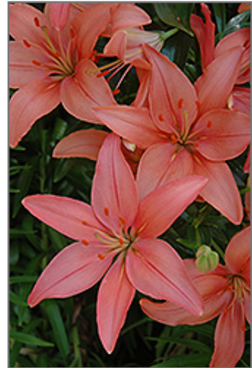
Lily Looks Tiny Toes Lily flowers