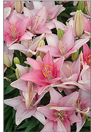
Lily Looks Tiny Icon Lily flowers