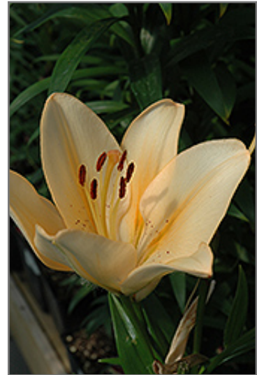
Salmon Classic Lily flowers