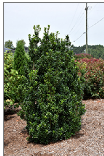
Castle Wall Meserve Holly