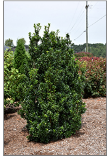
Castle Wall Meserve Holly