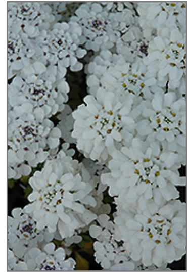
Masterpiece Candytuft flowers

Masterpiece Candytuft will grow to be about 10 inches tall at maturity, with a spread of 24 inches. When grown in masses or used as a bedding plant, individual plants should be spaced approximately 18 inches apart. Its foliage tends to remain low and dense right to the ground. It grows at a medium rate, and under ideal conditions can be expected to live for approximately 10 years. As an evergreen perennial, this plant will typically keep its form and foliage year-round.