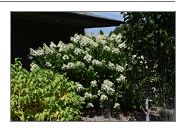
Chantilly Lace Hydrangea in bloom

Chantilly Lace Hydrangea will grow to be about 5 feet tall at maturity, with a spread of 6 feet. It tends to be a little leggy, with a typical clearance of 1 foot from the ground, and is suitable for planting under power lines. It grows at a medium rate, and under ideal conditions can be expected to live for 40 years or more.